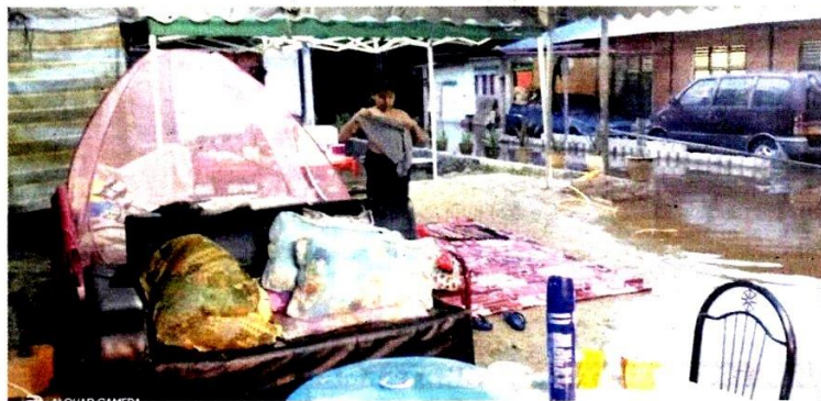
Lima beranak terpaksa tinggal di bawah khemah ditutupi kelambu pada waktu malam di luar rumah berikutan keseluruhan rumah mereka dinaiki banjir sejak dua minggu lalu.

Rumah dinaiki banjir sejak dua minggu lalu, tiada pilihan sementara menunggu banjir surut