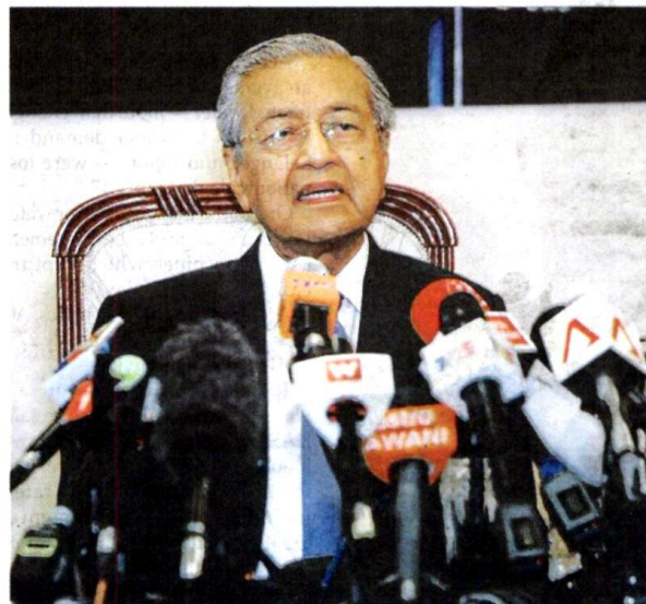
Dr Mahathir points out that it makes no sense for him to reject the cooperation in PN and remain as the PM, if it was he who initiated the plan

"I have been told about Azmin's accusation that I was the one planning the establishment of PN. I have repeatedly explained that this is not true at all because PN is made up of kleptocrats and is